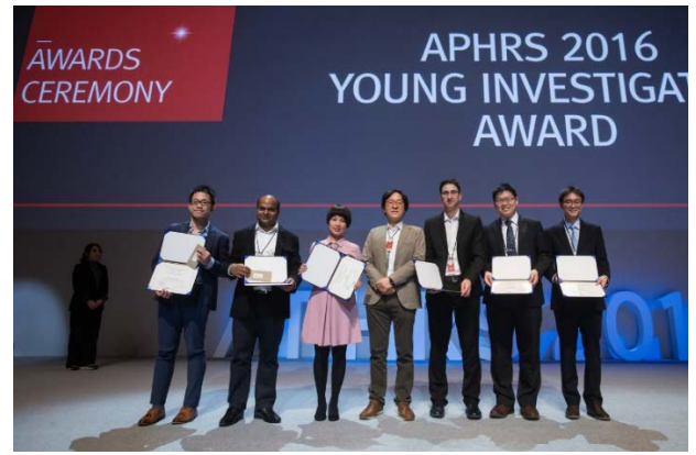
Young Investigator Awards Ceremony