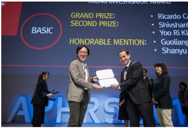
Young Investigator Awards Ceremony