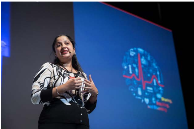
Keynote Speech at Opening Ceremony

medicine could coexist. And the faculty dinner presented a song about a young boy's sudden death caused by Brugada and/or ARVC, and the last line of the song was: "EP is my life, EP is my destiny." Also, unlike previous APHRS Scientific Sessions, this year's APHRS held the Closing Ceremony to officially announce the end of the meeting during which the flag handover ceremony took place for the first time in APHRS history to hope for the success of next year's APHRS Scientific Session.