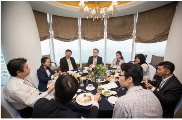
Breakfast with Master