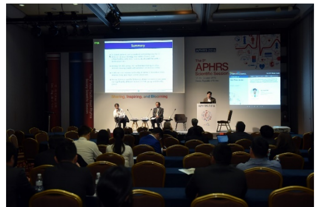
Late-breaking Trial Presentation