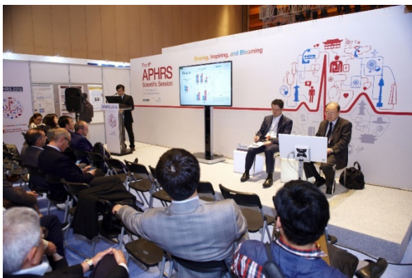
Mini Oral Presentation

A total of 622 abstracts including late-breaking trial were submitted from 31 countries to APHRS 2016. Among them were 51 abstracts presented orally, 35 abstracts in mini oral presentation, 12 abstracts at the Young Investigator Session, 12 abstracts in late-breaking trial presentation, and 418 abstracts in poster presentation. Young Investigator Award winners were awarded at the closing ceremony.